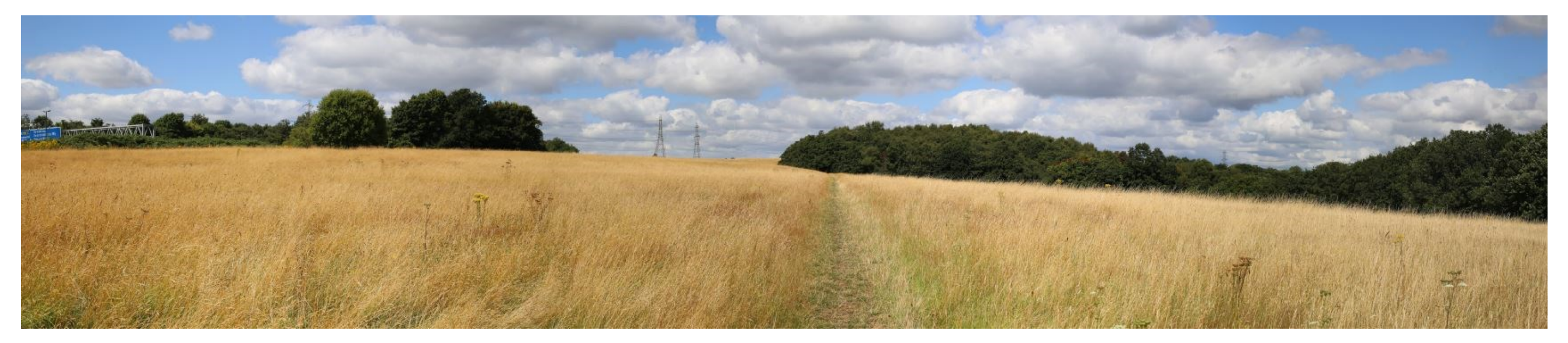
IV10 – View north in the Great Meadow looking towards Gilbert's Wood