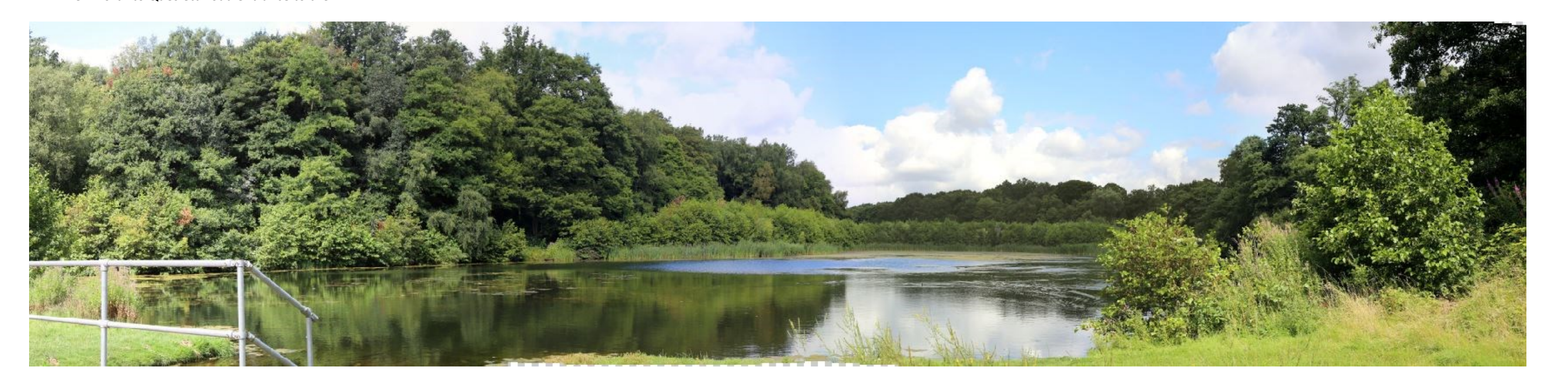
IV2 – View north across the lower lake