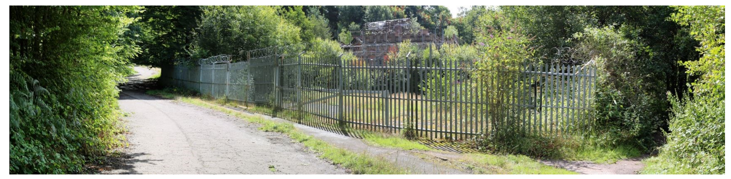
IV9 – View south east towards the Hall from the Suttons Drive approach