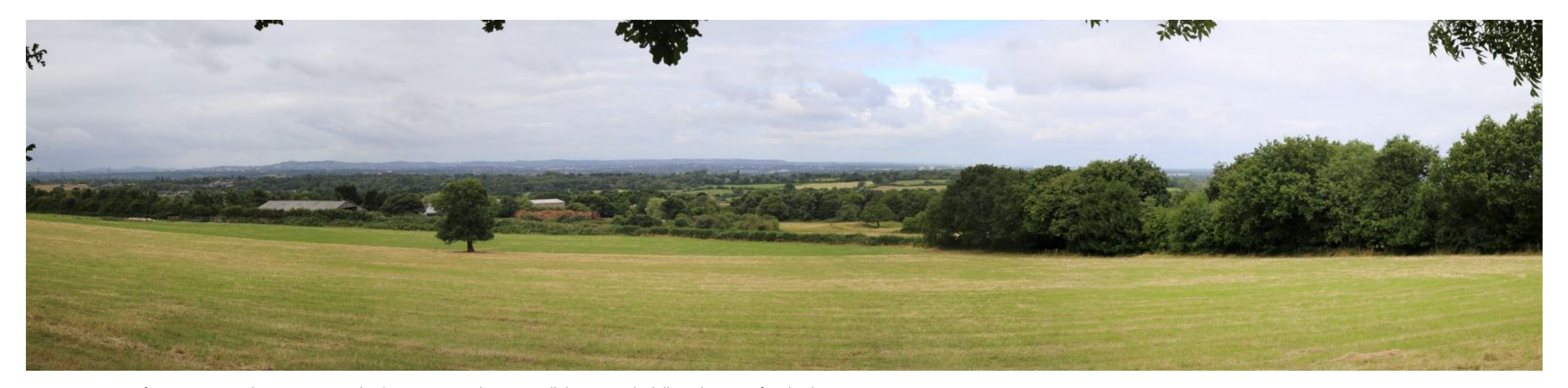
Ex IV8 – View west from Beacon Road across a pasture landscape apparently running all the way to the hills to the west of Wolverhampton