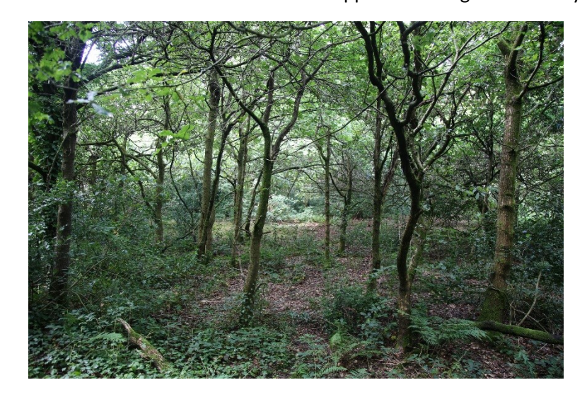
IV6 – From Hall west over former terrace towards the lake now overgrown