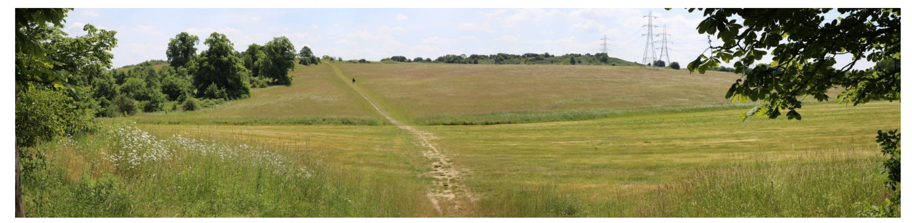
IV12 – View south from Suttons Drive across the Grand Meadow