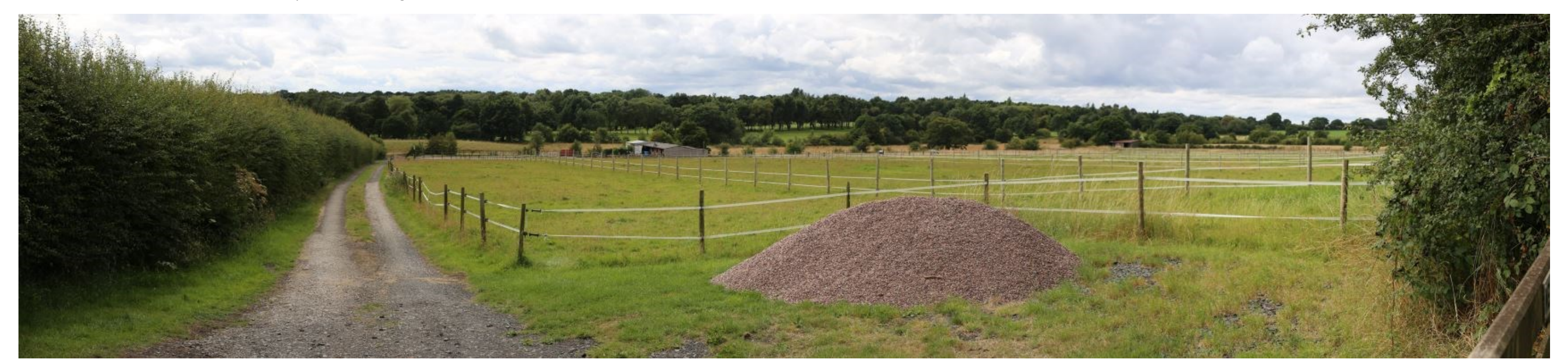
EX IV7 – View south west down access track to Meadow View with sight to Merrion's Wood and the Great Barr Golf Club forming the well treed middle ground and horizon