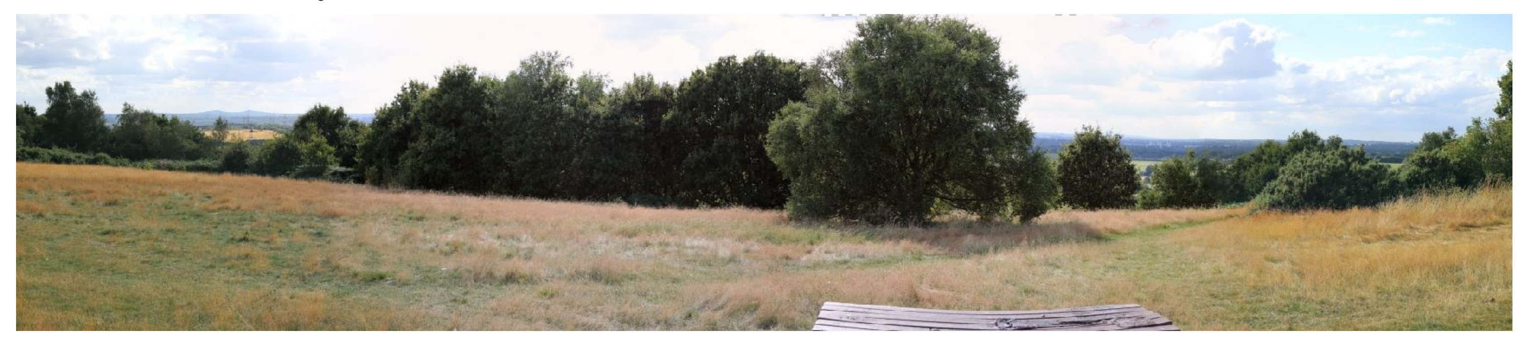
EX IV3 – View west from the summit of Barr Beacon

The location of the views is marked on RPS Drawing CAAMP Plan No. ??