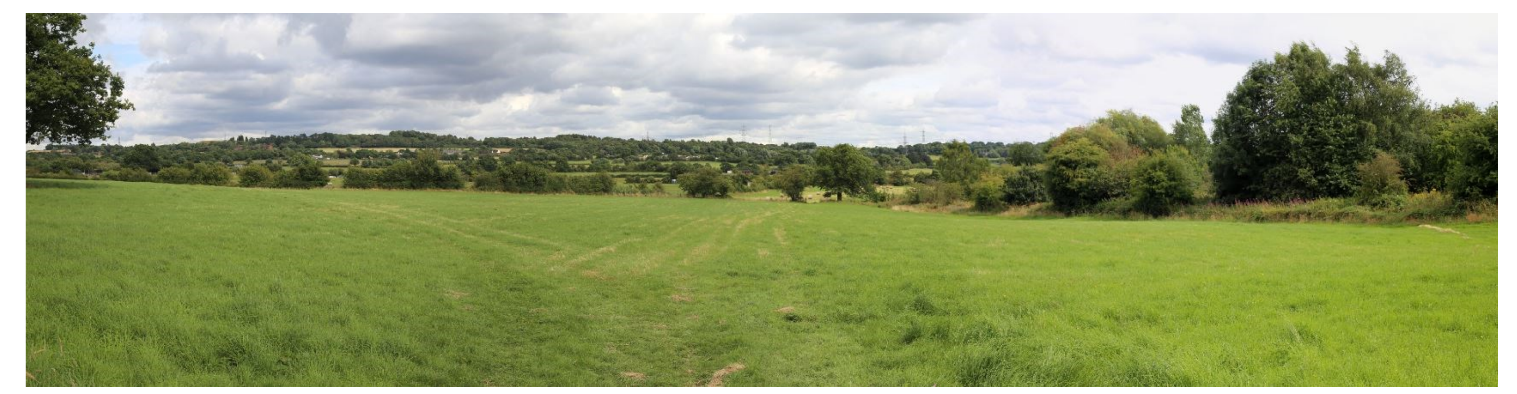
EX IV9 – View east from Skip Lane across the rural landscape of the Holbrook drained land towards Barr Beacon and the RHP that read as one continuous wooded ridge at this distance