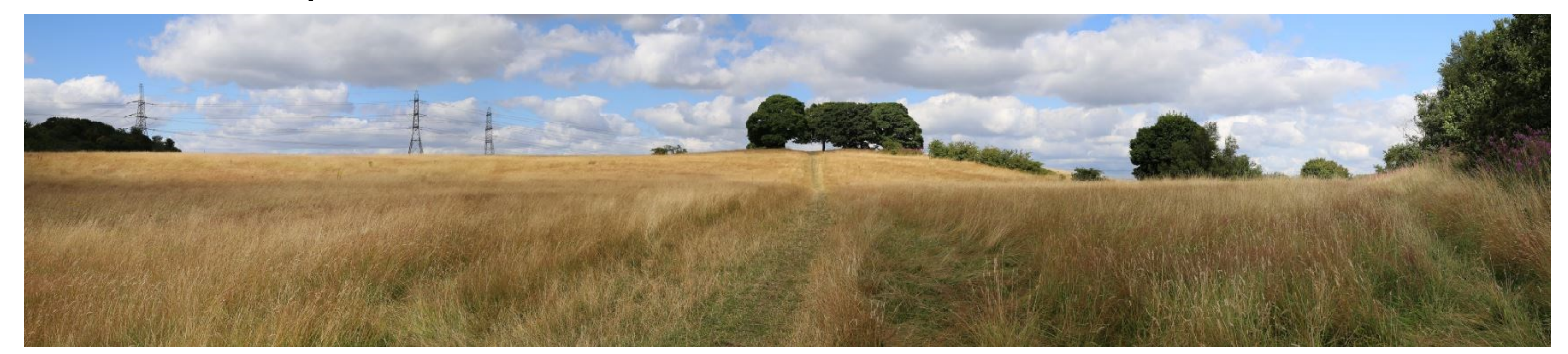
EX IV1 – Looking north within the Great Meadow towards a raised, planted knoll at the centre of the meadow