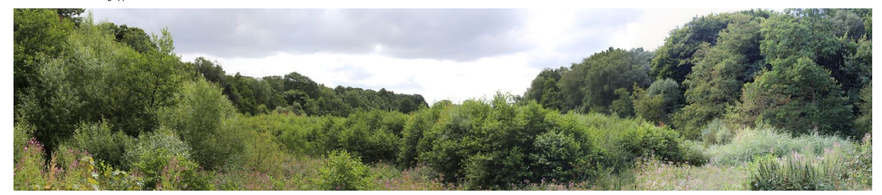
V4 – Part 2 View south over lower lake from middle cascade