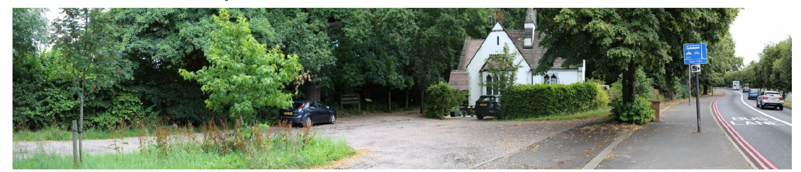
IV20 – View south west into Merrion's Wood past the Birmingham Road lodge entrance