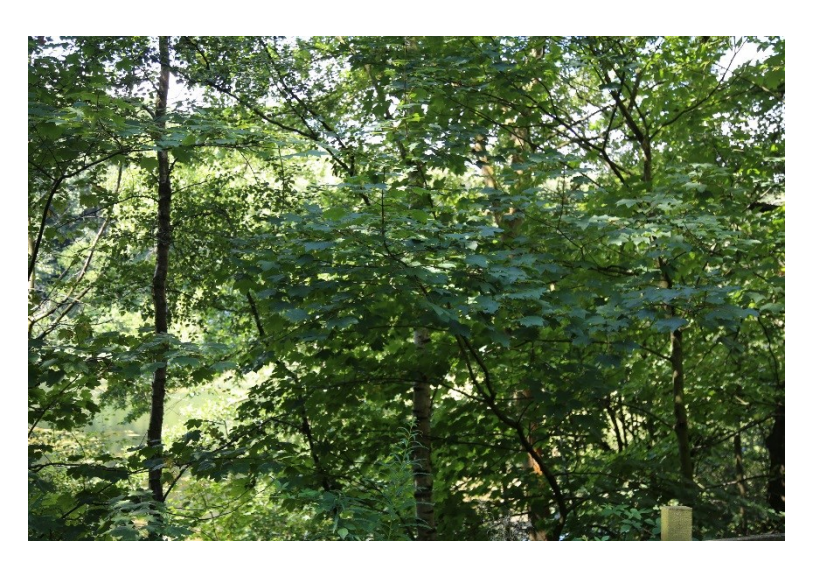
IV3 – View from Nether Hall Park access road to lake screened by woodland growth