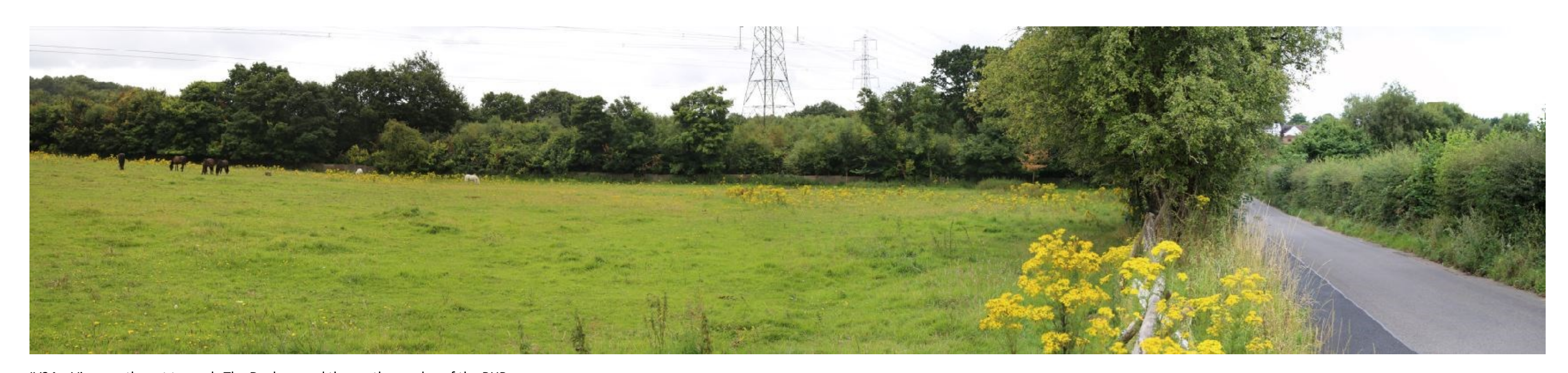
IV24 – View south east towards The Duckery and the northern edge of the RHP