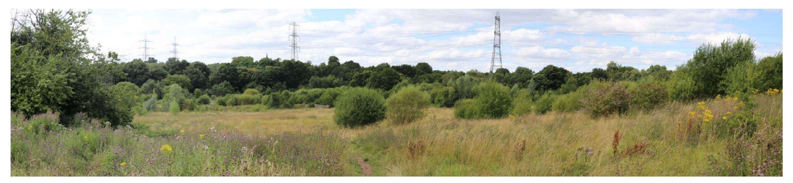
IV15 – View west from northern parkland towards St Margaret's Church