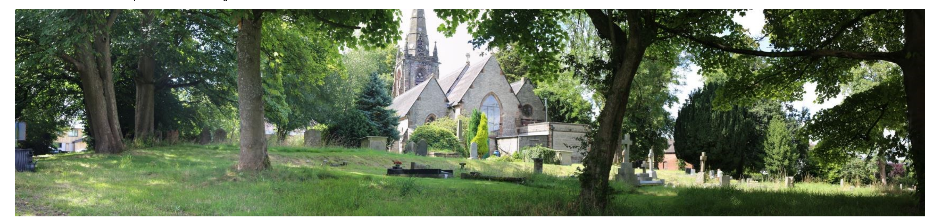
{\sf IV16-View\ west\ towards\ St\ Margaret's\ Church\ from\ within\ churchyard}