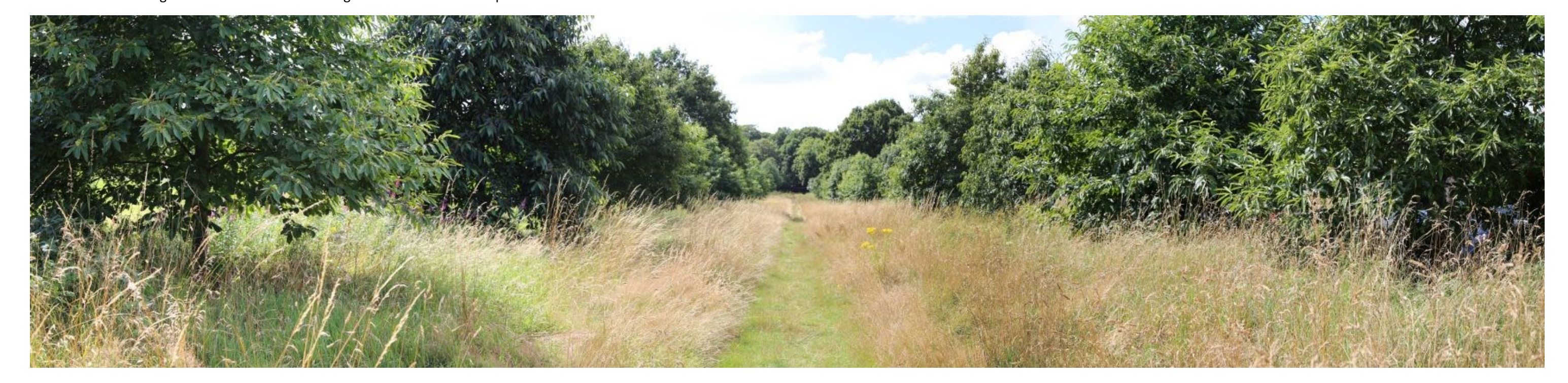
\label{eq:looking} \mbox{IV18-View west along Merrion's Wood drive looking towards the wood itself}