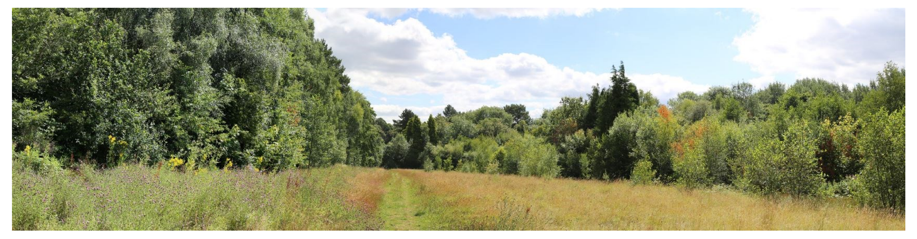
IV 13 – View south from north part of the parkland looking along straight ride back towards the Hall