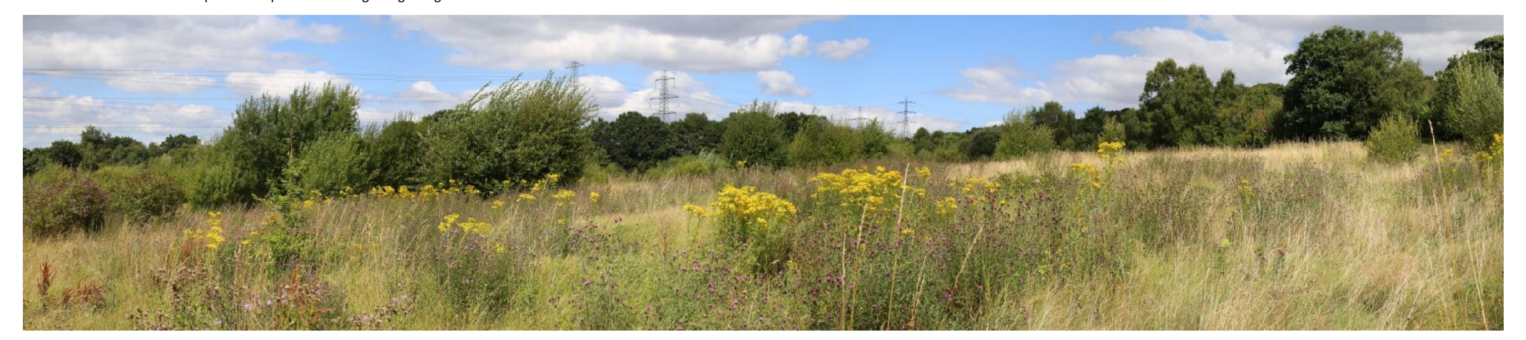
IV14 – View north from northern part of parkland towards Old Hall Farm