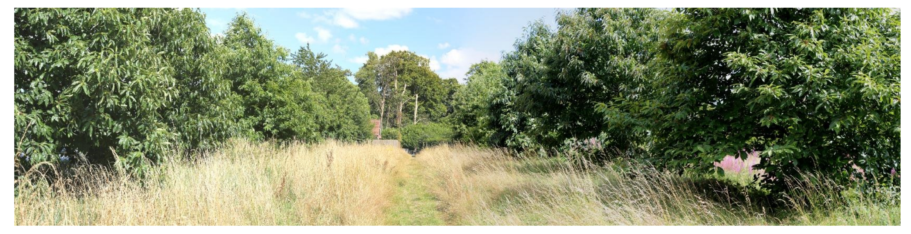
IV17 – View east along Merrion's Wood drive looking back towards the main parkland