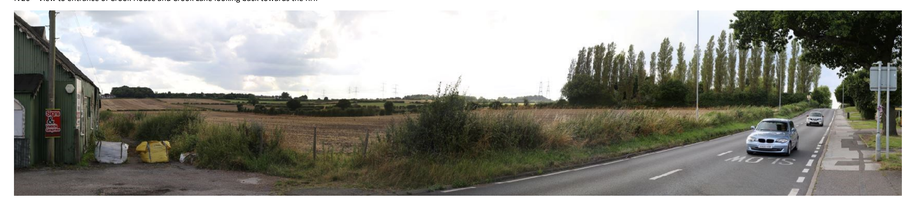
EX IV5 – View to Barr Beacon from Aldridge Road taking in the Tin Tabernacle