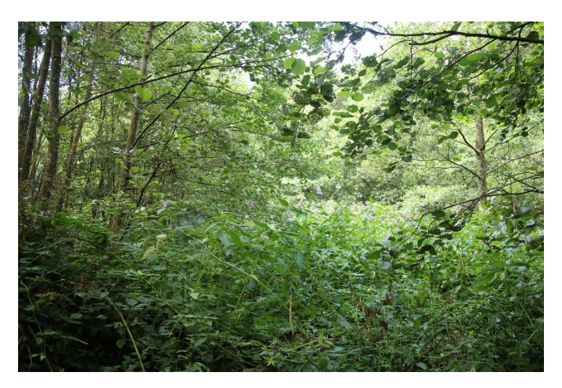
IV5 – From Hall south west towards upper lake but grown over by woodland