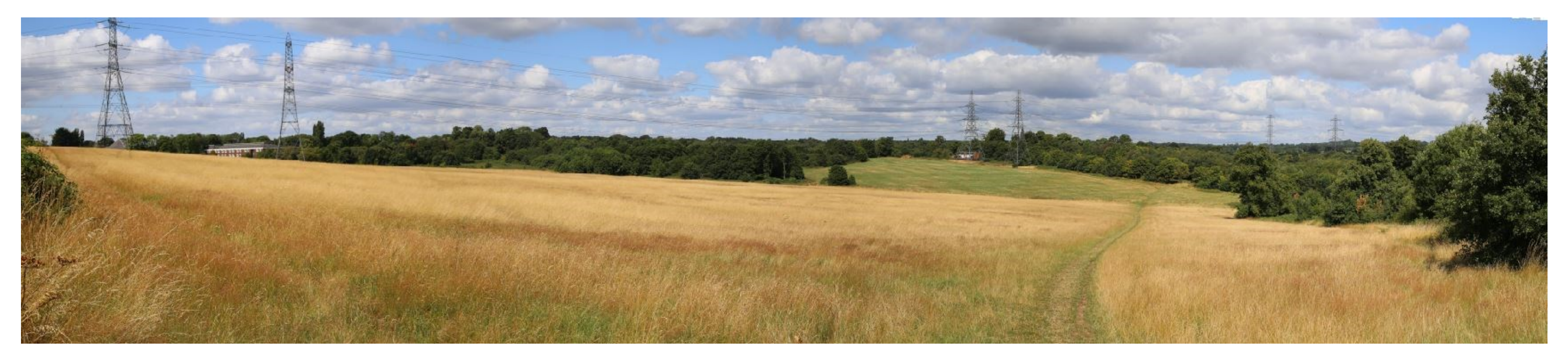
Ex IV2 – View from the knoll to the north east across the Great Meadow towards the position of Great Barr Hall