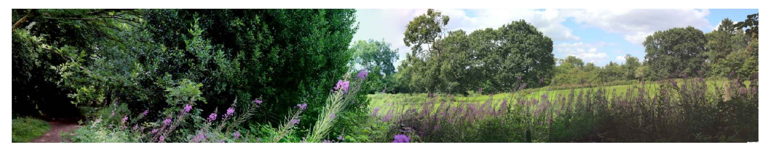
IV19 – View to small field set to the north of Merrion's Wood Birmingham Road entrance