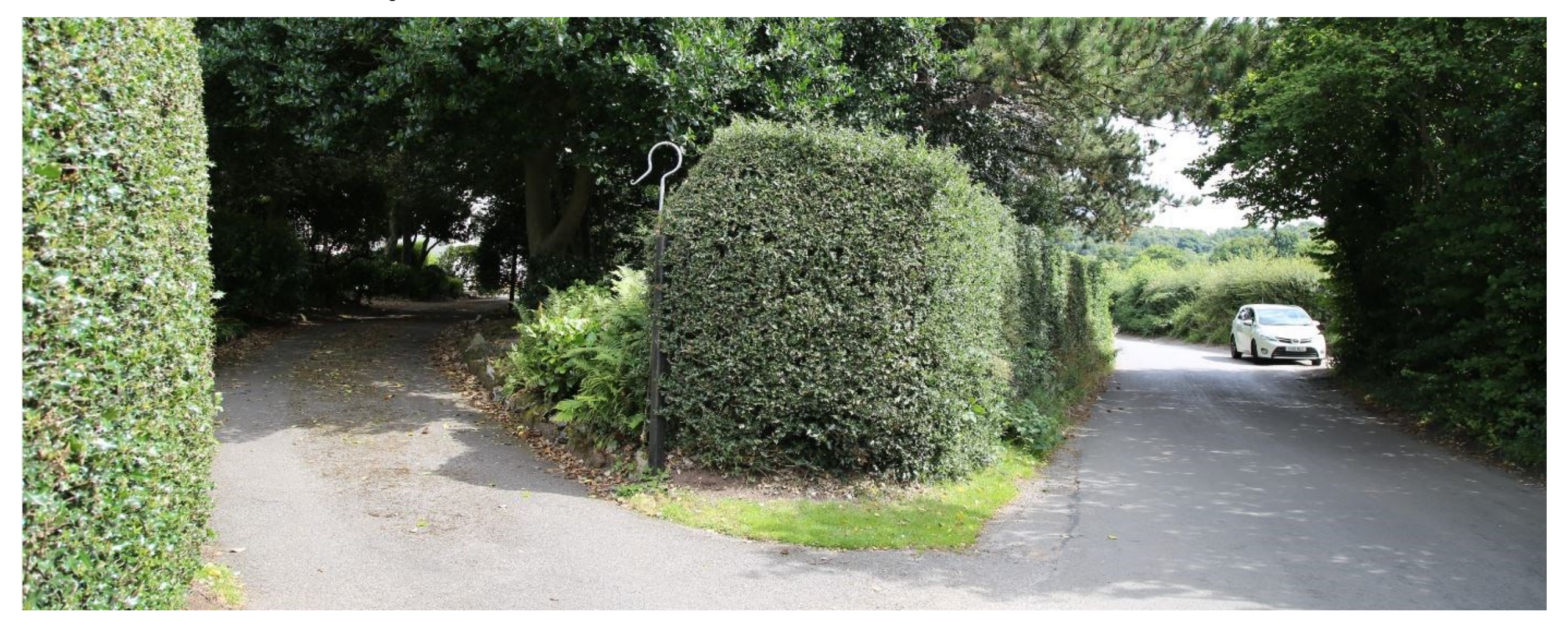
IV26 – View to entrance of Crook House and Crook Lane looking back towards the RHP

The location of the views is marked on RPS Drawing CAAMP Plan No. ??