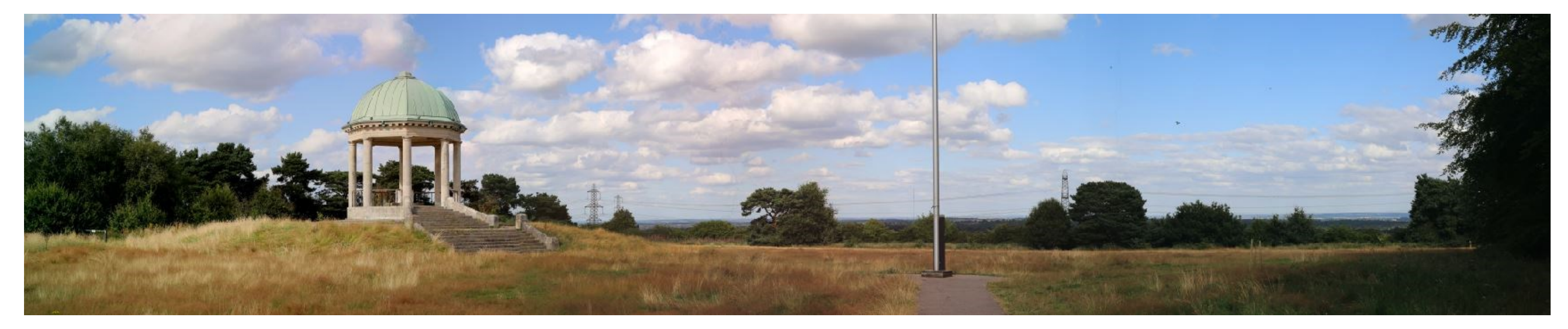
EX IV4 – View east from the summit of Barr Beacon taking in the First World War Memorial