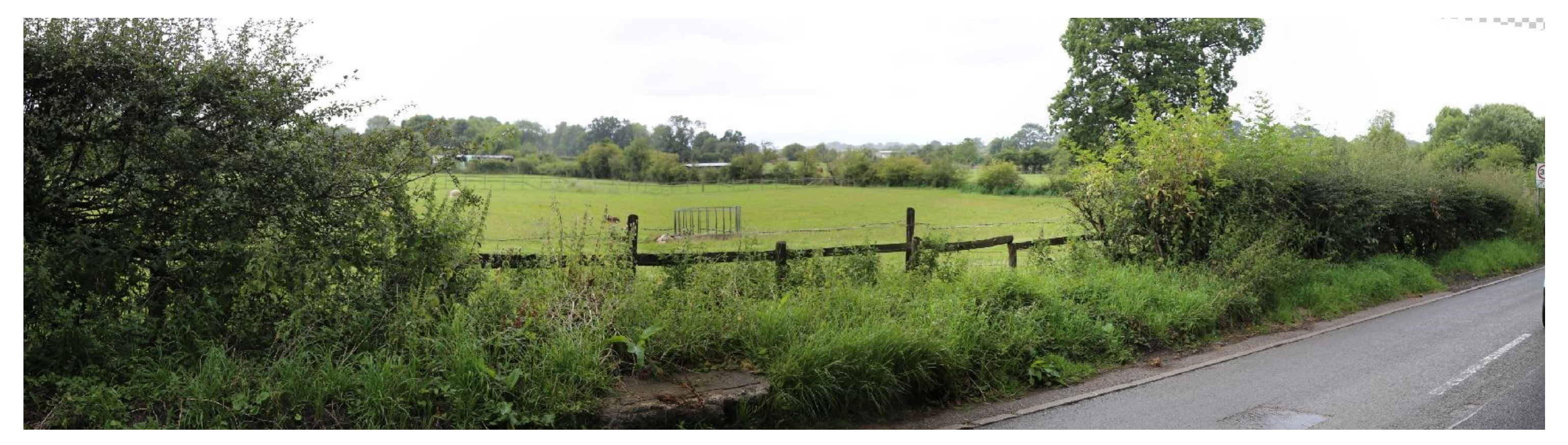
IV21 – Viewing north west from Chapel lane towards the rural are of the former wider estate