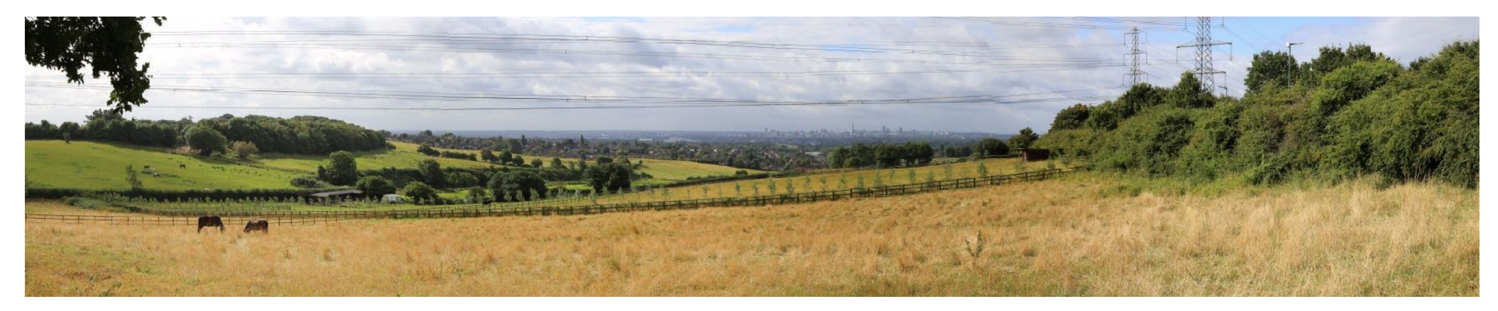
EX IV6 – View south down the Doe Bank valley towards Birmingham in the distance