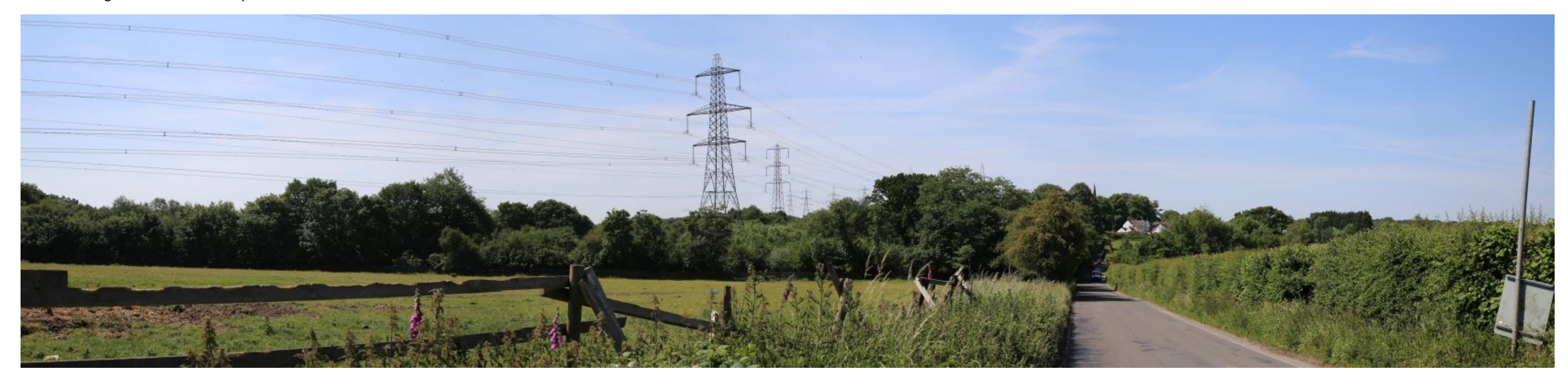
IV23 – View south down Chapel Lane towards the spire of St Margaret's Church and the edge of Great Barr Village