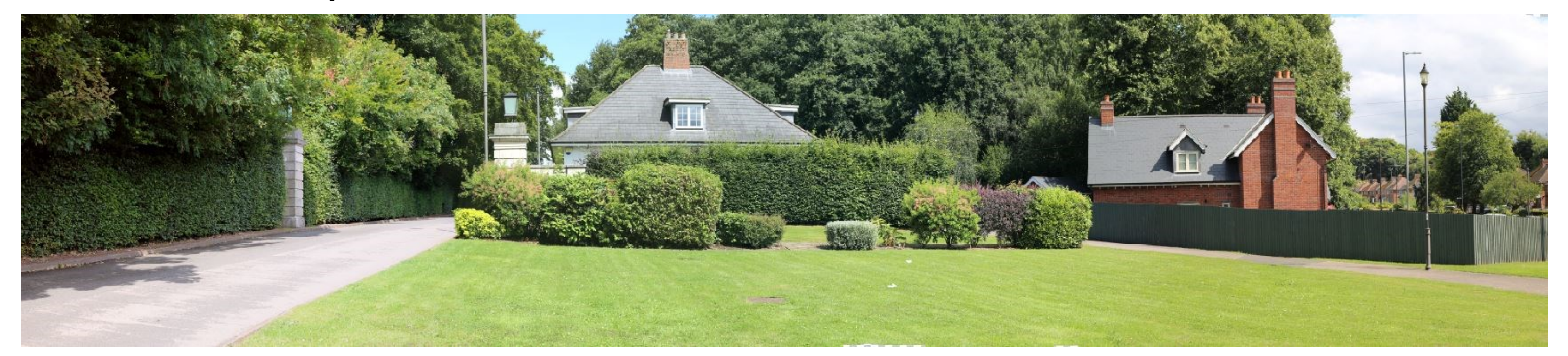
IV1 – View north to Queslett Road entrance to the RHP.

The location of the views is marked on RPS Drawing CAAMP Plan No. ??