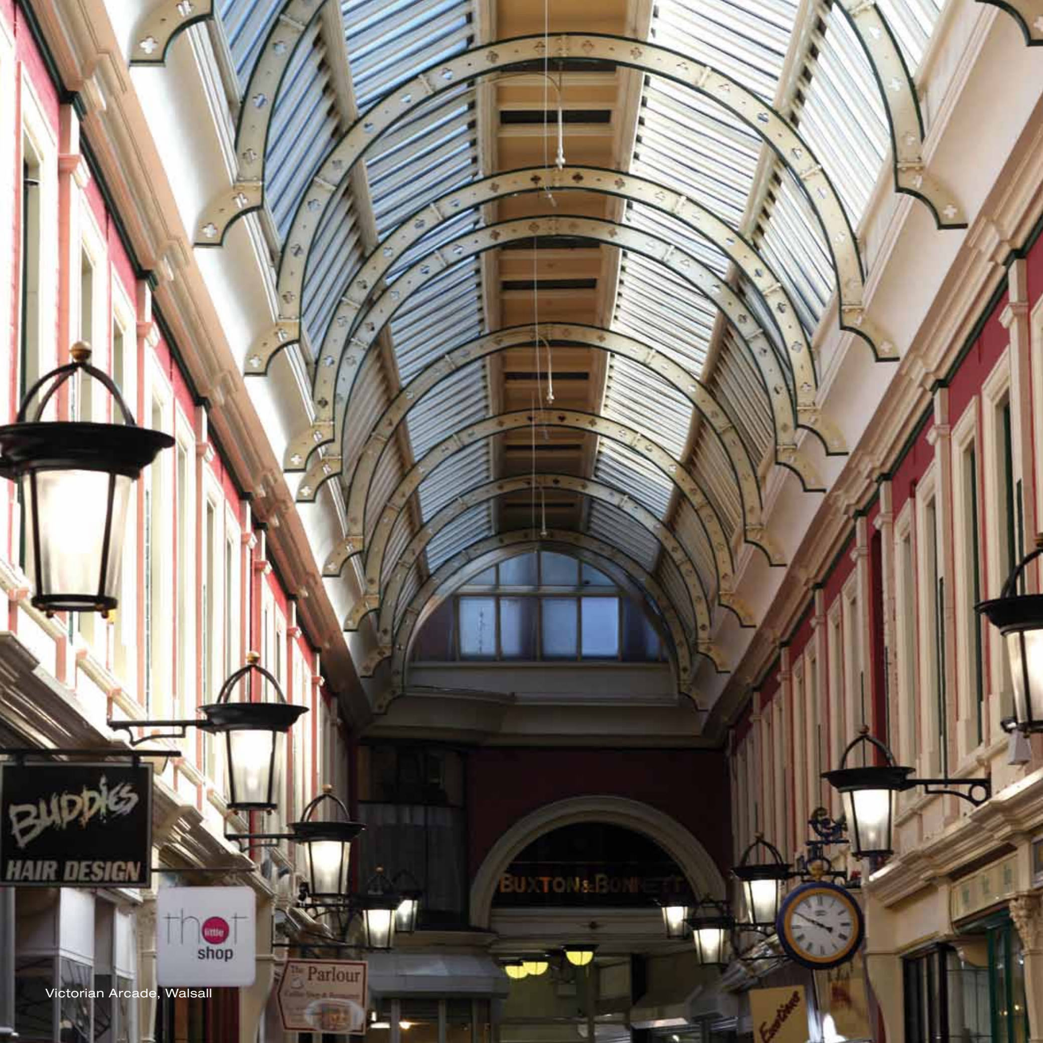
Victorian Arcade, Walsall