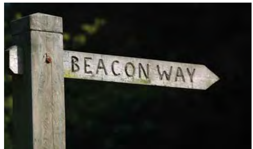
Rural legible signage

Design is a fundamental and often overarching principle of planning as it touches on all other aspects of development management and policy. Issues of transportation, parking, greenbelt, housing, ecology, environmental contamination and other topics all benefit from separate detailed policy and guidance of their own and whilst touched on in this design document, are not discussed in depth as they are addressed within the wider Development Plan.