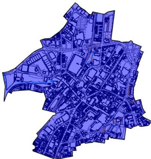
Limestone (+500m Buffer Zone)