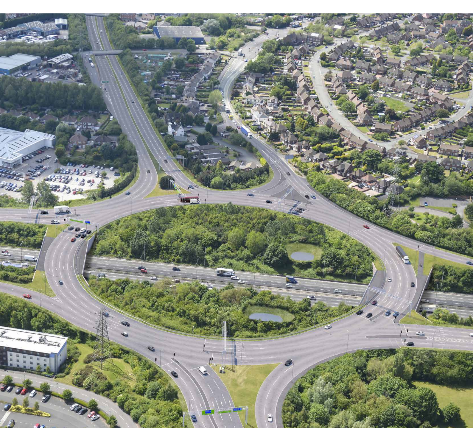
Proposed improvements to M6 Junction 10